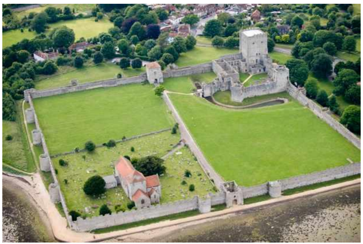
You're gonna need more than a gate on your gated community. In the age of automatic weapons, mortars, artillery, air craft, and bio- weapons, a big wall won't help much either.