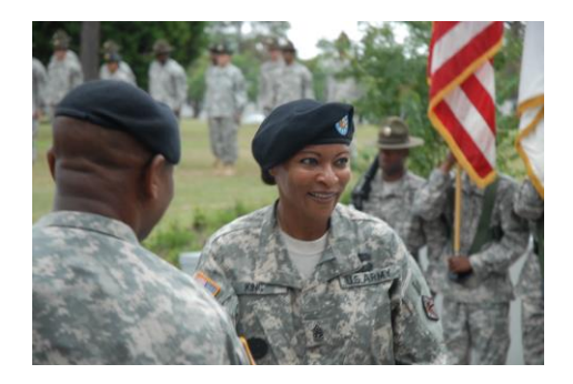
Black Leaders Matter