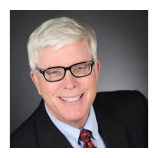
NATIONAL RADIO AND TV COMMENTATOR HIGH HEWITT AT COLAB DINNER