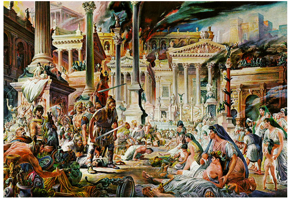
As the Goths, Franks, Vandals and other Germanic groups took over the cities, the upper classes fled to country estates. The solution was only temporary.