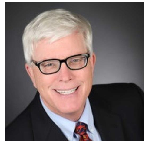
NATIONAL RADIO AND TV COMMENTATOR HIGH HEWITT AT COLAB DINNER